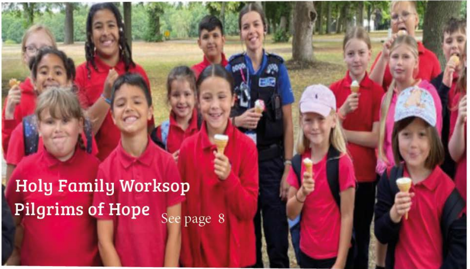
Holy Family Workshop Pilgrims of Hope See page 8

A Community called to love one another as Christ loves us.