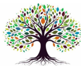
Ignatian Training & Formation Courses