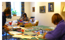
Short Courses & Series