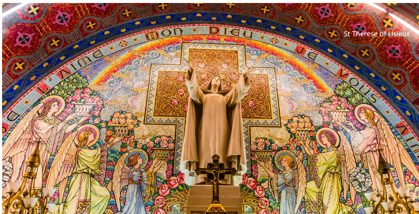
St Therese of Lisieux