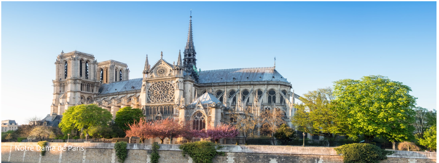
Notre Dame de Paris