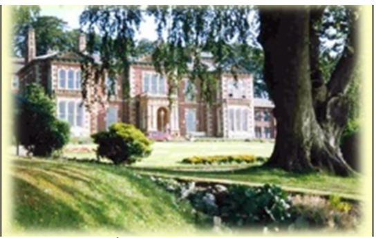
28 June-1 July 2024

Why? Catholic Social Teaching has been described as 'the Church's best-kept secret'. It offers a fresh way of understanding moral and social questions, deeply rooted in e Gospel, but accessible to anyone. It has rich resources for renewing a tired and confused political world. Ideal reflection for election year!