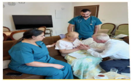
Hallam based Charity launches a new and groundbreaking service in Bethlehem. Find out more on page 7