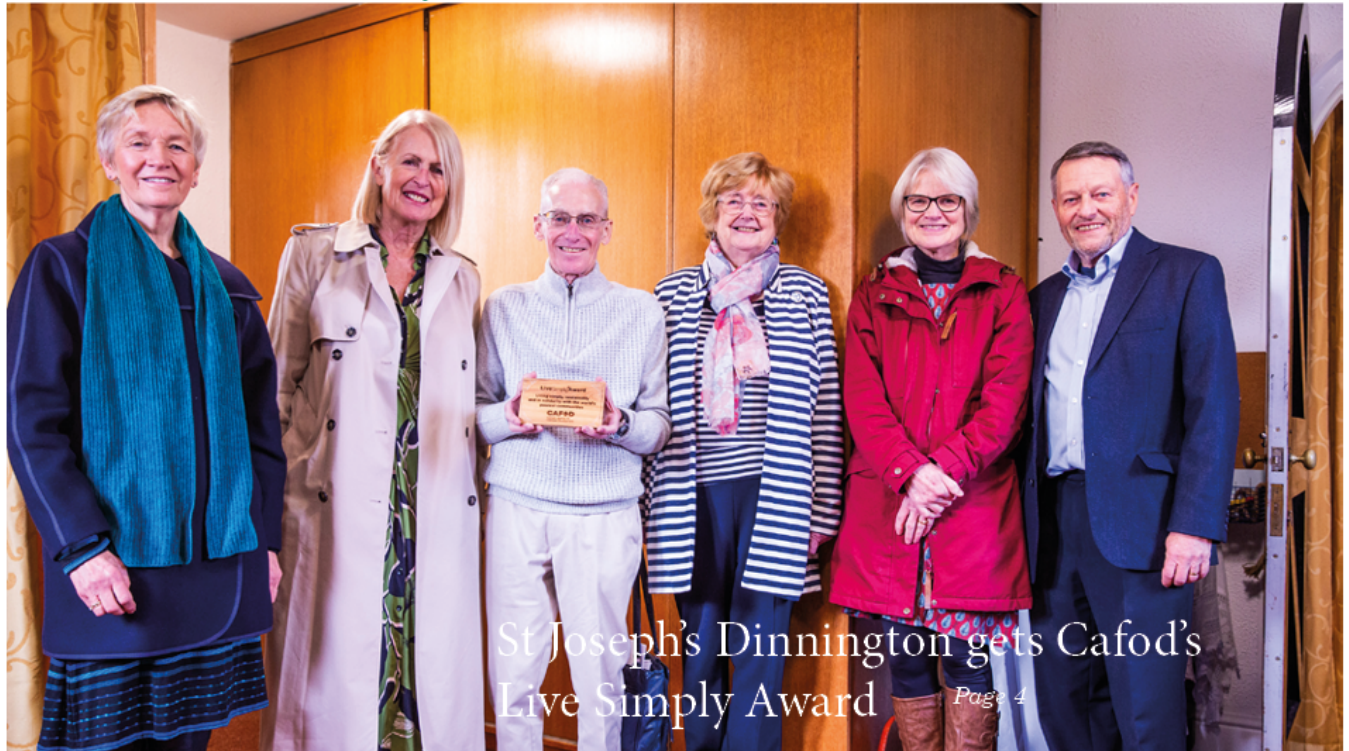
St Joseph's Dinnington gets Cafod's Live Simply Award Page 4

A Community called to love one another as Christ loves us.