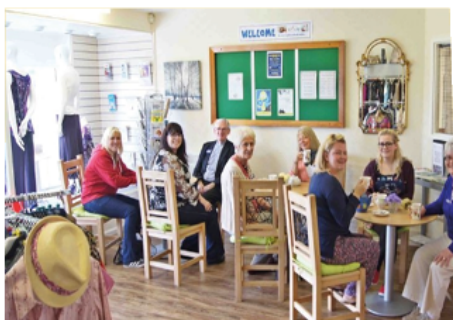
Read all about it on page 5