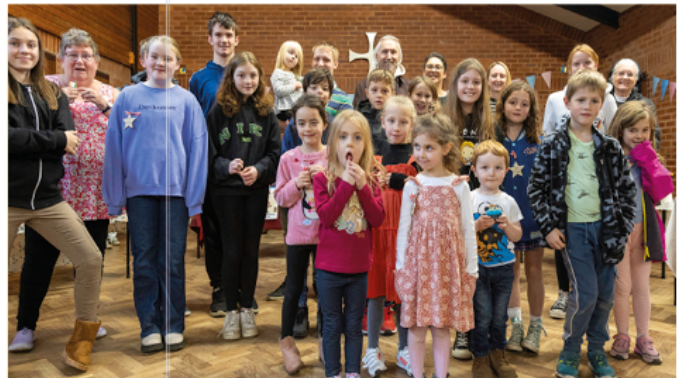
Our Lady and St Thomas, Sheffield holds a parish bake off Find out more on page 4